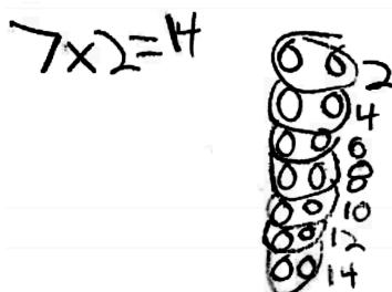
Fig. 0.2. A second grader's solution for "How many eyes are in our room?"

Hank, a second grader, not only skip-counted by twos to find the number of eyes but provided an equation documenting his solution: