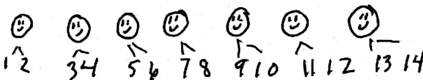
Fig. 0.1. A possible first-grade solution for "How many eyes are in our room?"

Younger children might count each of their friends, pointing to each friend twice, to count the number of eyes. A first grader might draw the following solution to the problem: