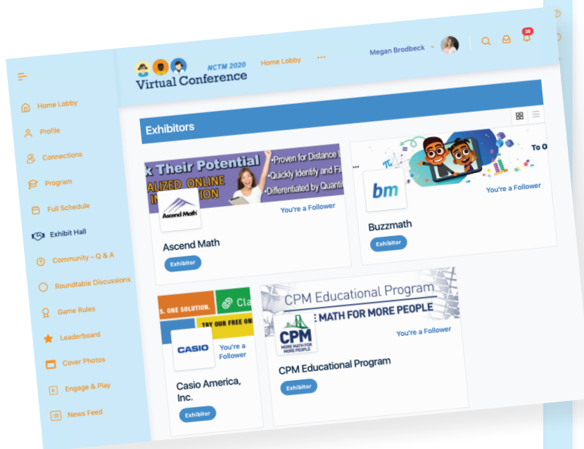
Virtual Exhibit Hall

Tuesday, February 2 . . . . . 10:00 AM - 3:00 PM EST Wednesday, February 3 . . . . 10:00 AM - 3:00 PM EST Thursday, February 4 . . . . . 10:00 AM - 3:00 PM EST Friday, February 5 . . . . . 10:00 AM - 3:00 PM EST