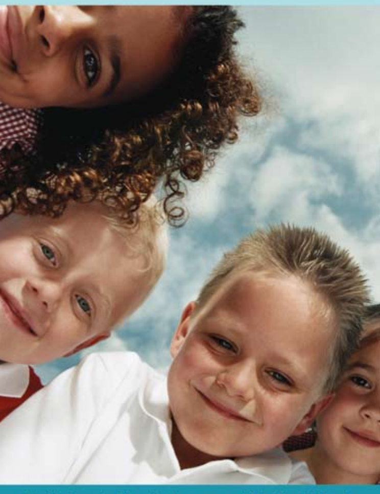
The Mathematics Education Trust was established in 1976 by the National Council of Teachers of Mathematics (NCTM).

Your gift, no matter its size, will help us reach our goal of providing a high-quality mathematics learning experience for all students.