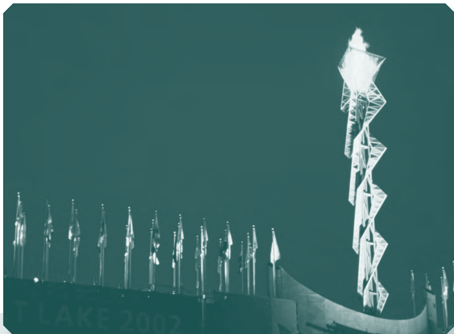
Olympic Cauldron; © Courtesy the Salt Lake Convention & Visitors Bureau