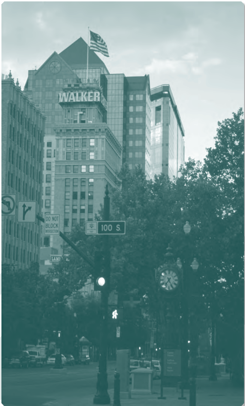
Walker Center, Downtown