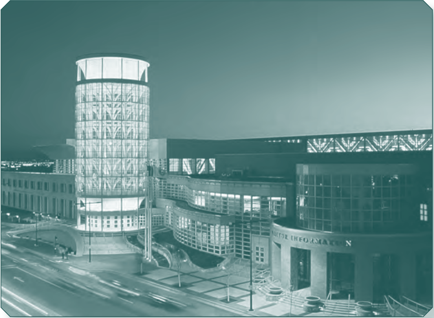
Salt Palace