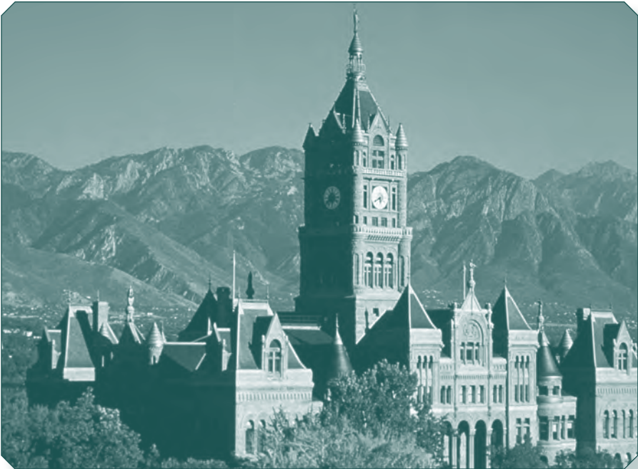
City and County Building; © Courtesy the Salt Lake Convention & Visitors Bureau